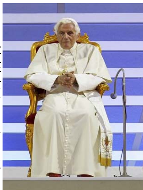
Pope Benedict XVI sits during a meeting with the families gathered for the celebration of the Feast of Testimonies at the 7th World Meeting of Families at Bresso Park in Milan June 2, 2012.

the pope said, describing the tradition of Sunday rest as “an oasis in which to pause... and celebrate the family.”