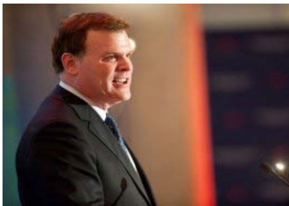
Canada’s Minister of Foreign Affairs John Baird speaks at the 10th annual Religious Liberty Dinner on May 24, 2012.

On May 24, 2012, The 10th Annual Religious Liberty Dinner was sponsored by the Seventh-day Adventist Church. This year the featured speaker was Canada’s Office of Religious Freedom Minister John Baird. Minister John Baird has a long history of taking a hard-line stance in defense of same-sex marriage, homosexuality, and support for gay rights around the world. In 2006, Baird voted against reopening the issue on the legality of Same-Sex marriage in Canada, which currently favors gays and lesbians.